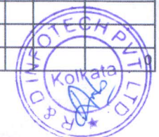
Table II - Statement showing shareholding pattern of the Promoter and Promoter Group